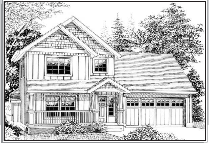
Elevations subject to change