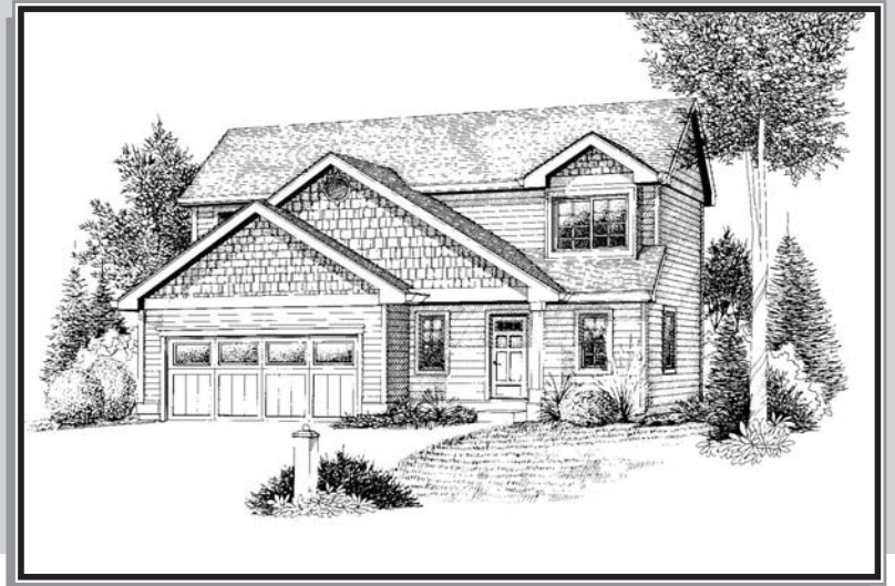
Elevations subject to change