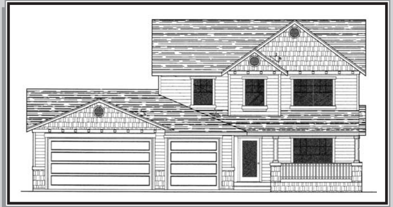
Elevations subject to change