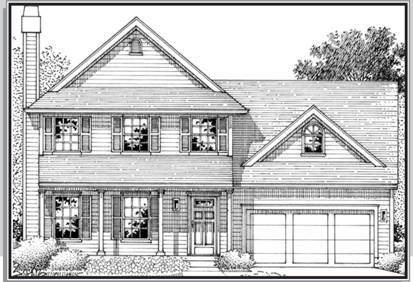
Elevations subject to change