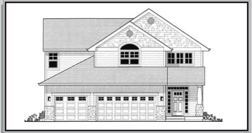
Elevations subject to change