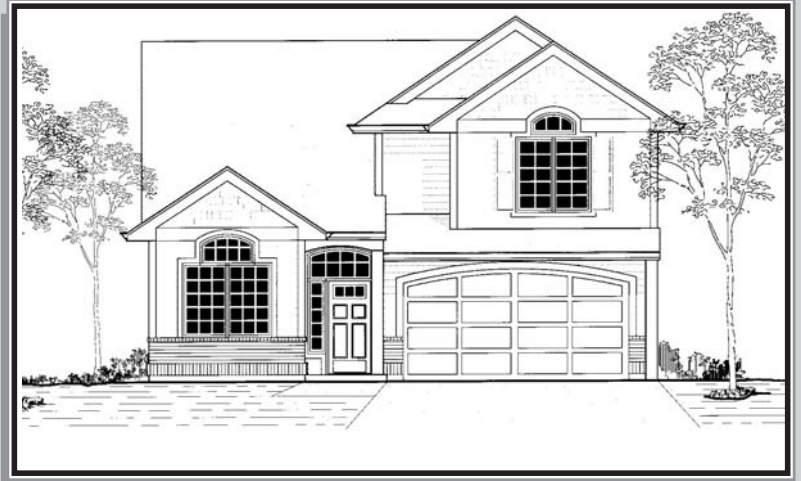
Elevations subject to change