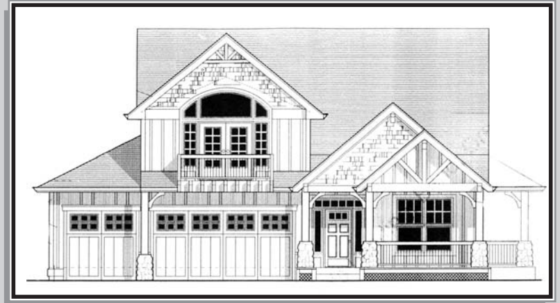
Elevations subject to change